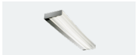
D-lite® vanera 39/39 W, Eco