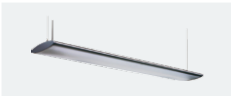
D-lite® amadea 2x54 C