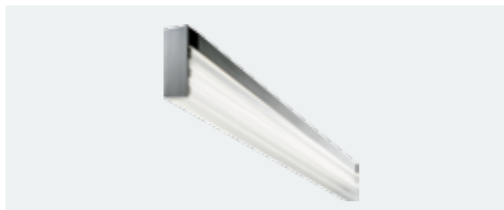
D-lite® vanera High-End 54/54 C, Eco D-lite® vanera High-End 39/39 C, Eco