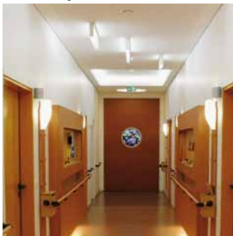
Find the right way: interaction between light and selected flooring